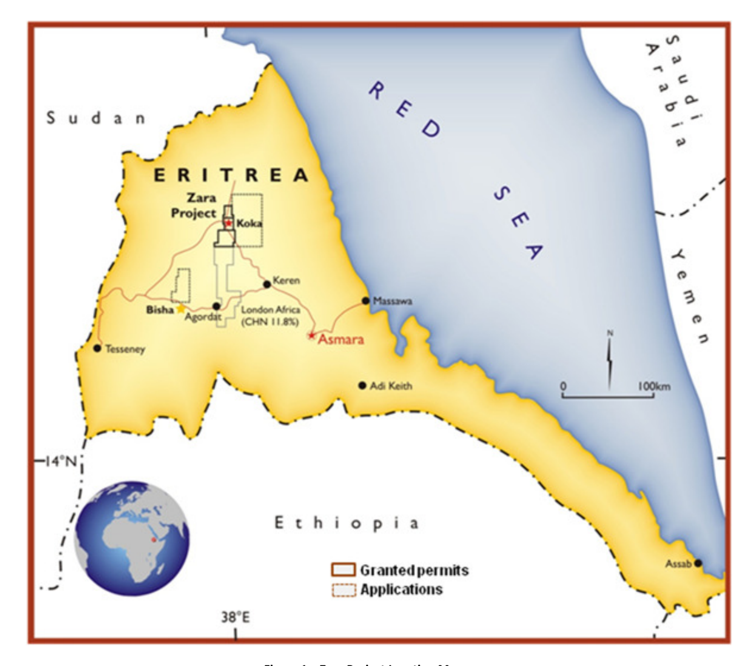
Figure 1 – Zara Project Location Map