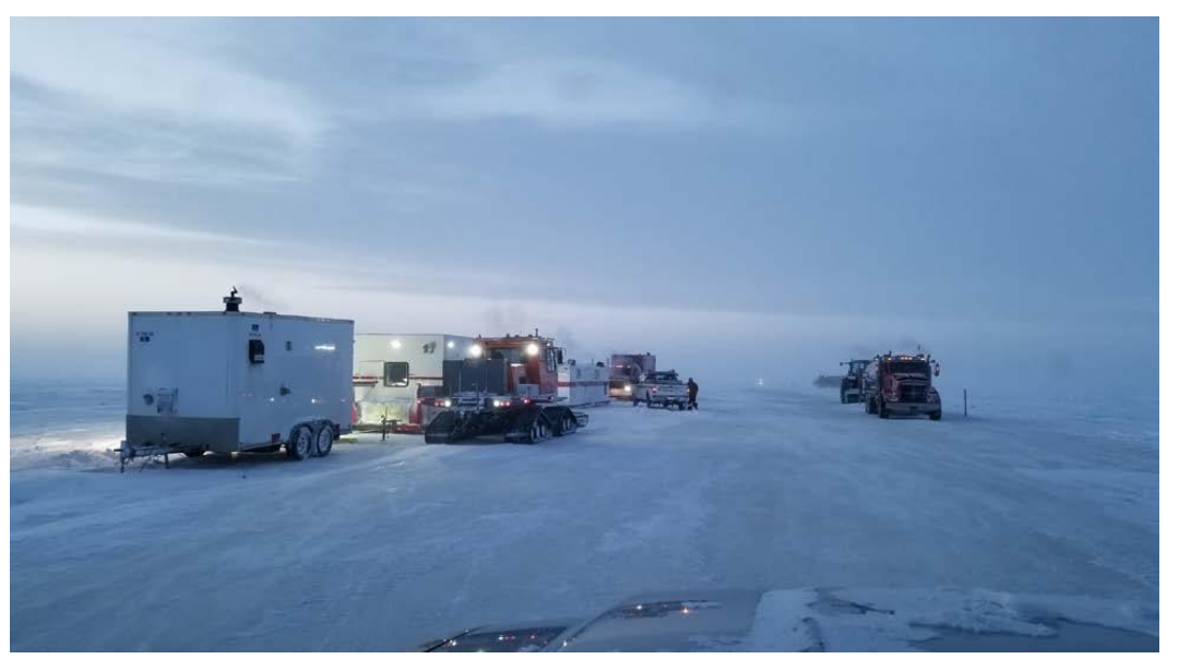
Figure 1 – Ice road construction in preparation for mobilisation of Nordic Rig # 3 in February

Construction of the approximately 11-mile (18 kilometre) ice road required for mobilisation of the drill rig is almost 50% complete, with construction of the ice pad, from which the Nordic Rig#3 will drill the Winx-1 well, to follow.