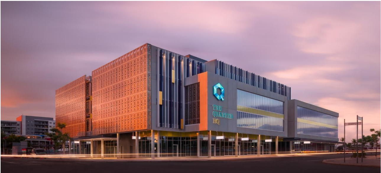
Figure 3: Location of BCI's Regional Office in Karratha

BCI has developed an Australian Industry Participation Plan for the Mardie Project, which was approved by the Department of Industry, Science, Energy and Resources in early January 2021. The plan provides a framework for BCI's engagement with Australian and local entities regarding contracting and procurement opportunities at the Project.