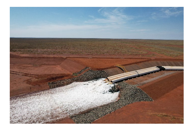
Figure 3: Commissioning of transfer station 2/3