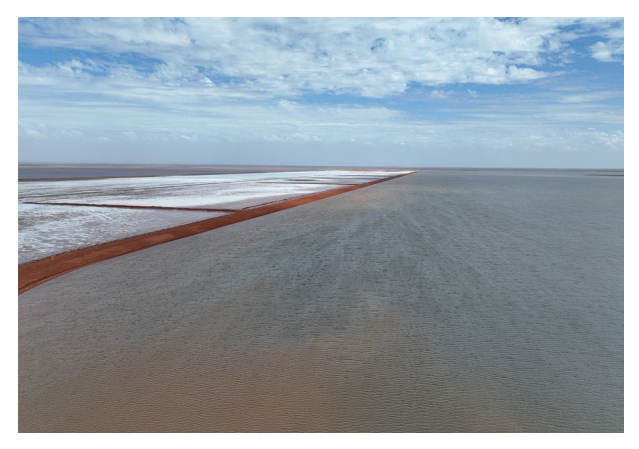
Figure 1: Water in ponds 1 to 3

BCI continues to target first salt on ship in Q2 FY27, positioning the Company as a major supplier of highquality industrial salt to global markets.