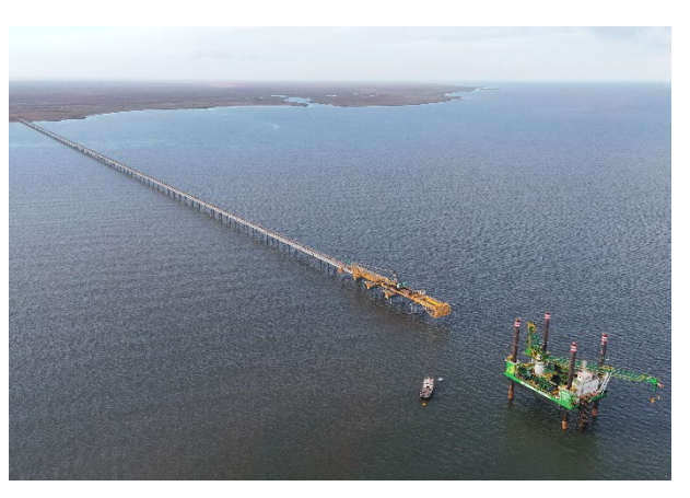
Figure 2: Jack-up barge arrives at Mardie to install the jetty head