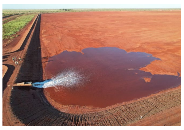
Figure 2: Commissioning Crystallisers (15 April 2025)