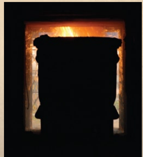
HOT IRON METAL POURING INTO LADLE, CHINESE STEEL MILL