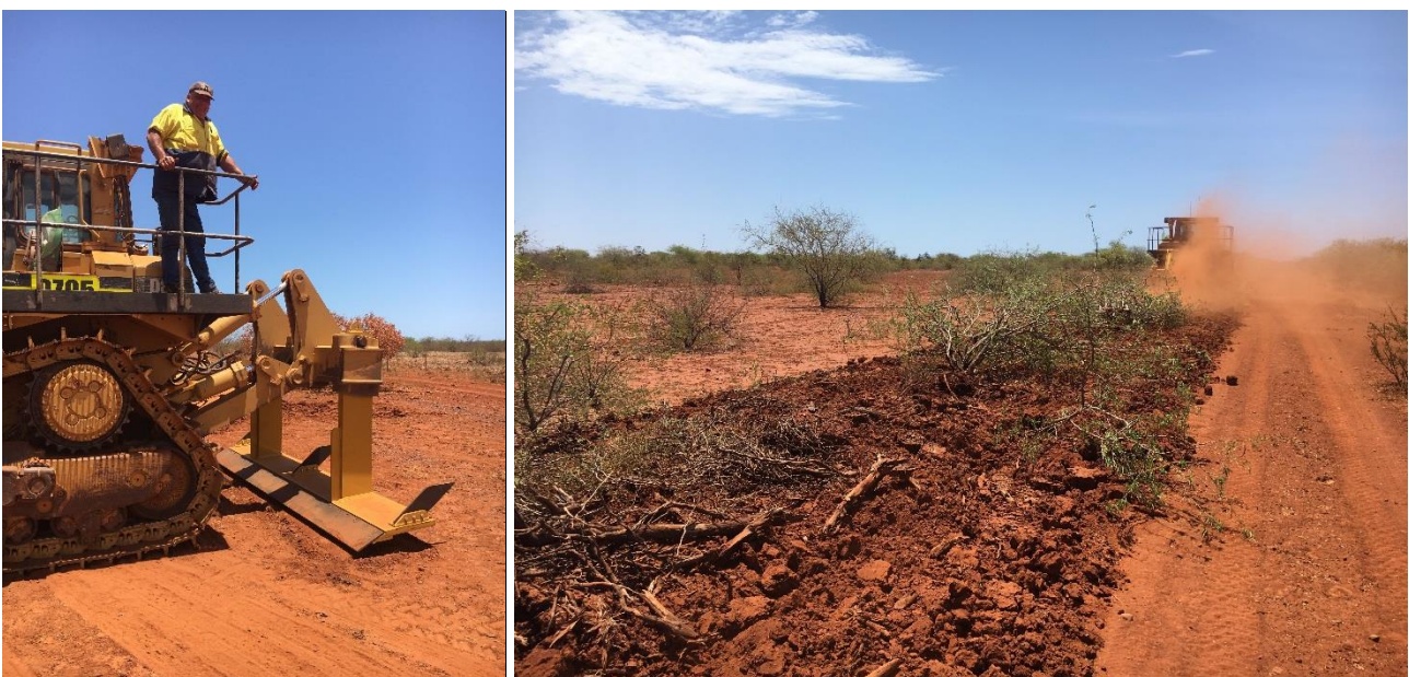
Figure 1: Mesquite Clearing at Mardie Using the Homan Plough

As part of BCI’s site preparation activities, it is collaborating with State Government departments and the local pastoralists in a campaign aimed at eradicating mesquite vegetation, a weed which is common in the region and is classified as one of 32 “Weeds of National Significance”. BCI has purchased a Homan plough specifically designed for the effective clearing of mesquite, and has deployed the plough with immediate success (see Figure 1).