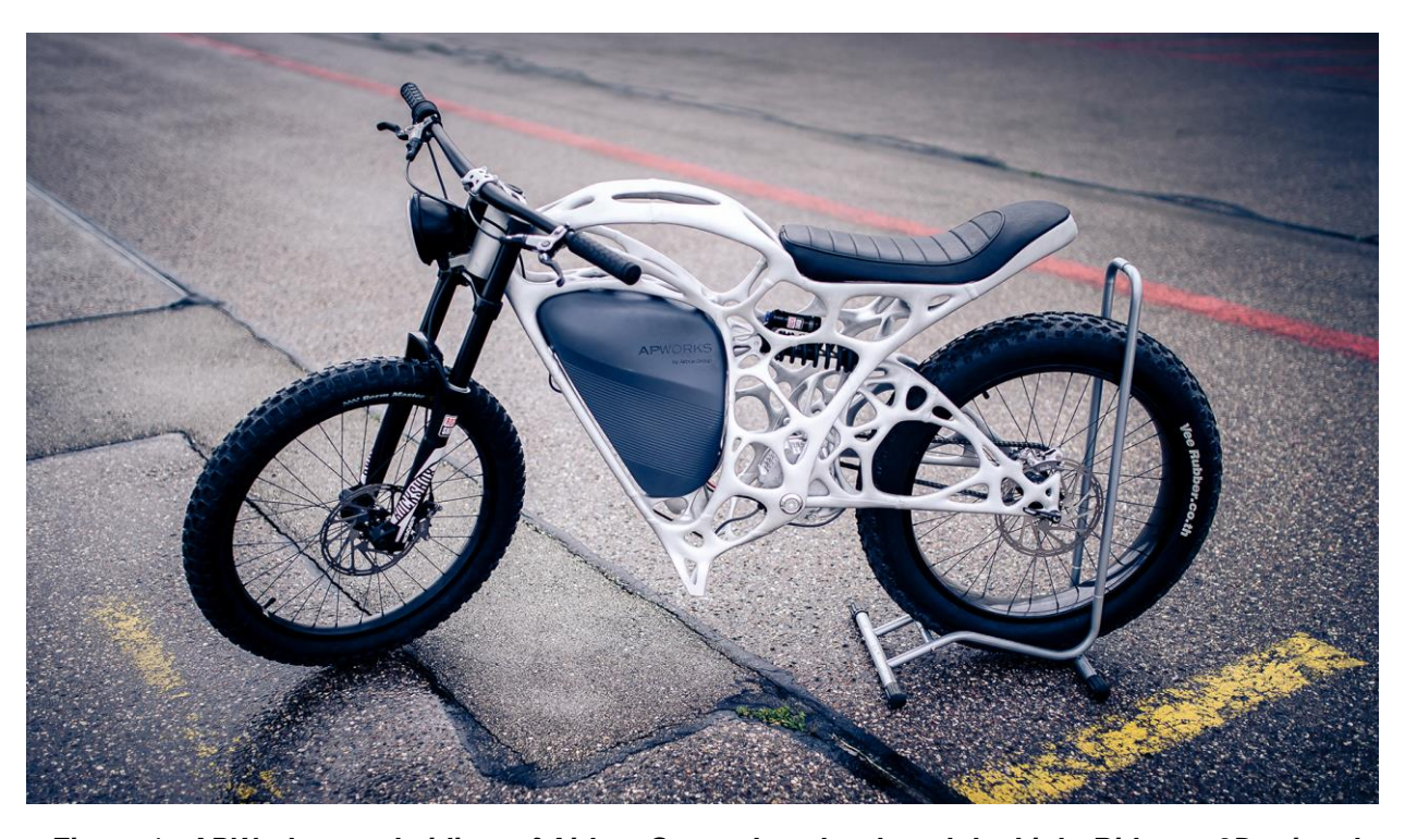
Figure 1: APWorks, a subsidiary of Airbus Group, has developed the Light Rider - a 3D printed Scalmalloy® (aluminium-magnesium-scandium alloy) electric motorbike which, weighing in at just 35 kg, is about 30% lighter than most conventional e-motorcycles. The Light Rider is capable of going from 0 to 80 km per hour in seconds and can travel close to 60 km between charges

Airbus Group Innovations ( AGI ) is Airbus' global network of research and technology centres for future aerospace challenges. AGI is taking care of development, qualification and commercialisation of Scalmalloy<sup>®</sup>, a patented 3D printing aluminium-scandium powder & direct manufacturing concept used in the production of high strength components for Airbus' fleet of aircraft.