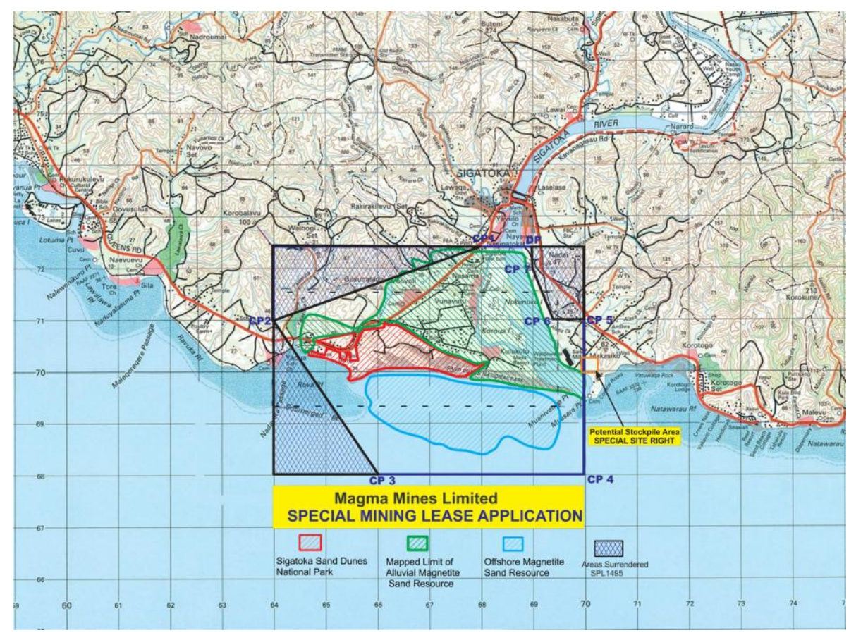
Figure 1 -Map showing the application area for a Mining Lease (Magma Mines Limited is a wholly owned subsidiary of Dome). Note the Sand Dune National Park outlined in red is excluded as are villages and other culturally restricted sites

The Company will now add to this existing database by sonic drill testing parts of the sand deposit that were not drilled previously (Koroura Island) or were drilled at a hole spacing that did not provide sufficient detail (freehold land nearer the coast). The data from this new program will be used to update the initial JORC 2012 resource estimate report and will be followed by a Definitive Feasibility Study.