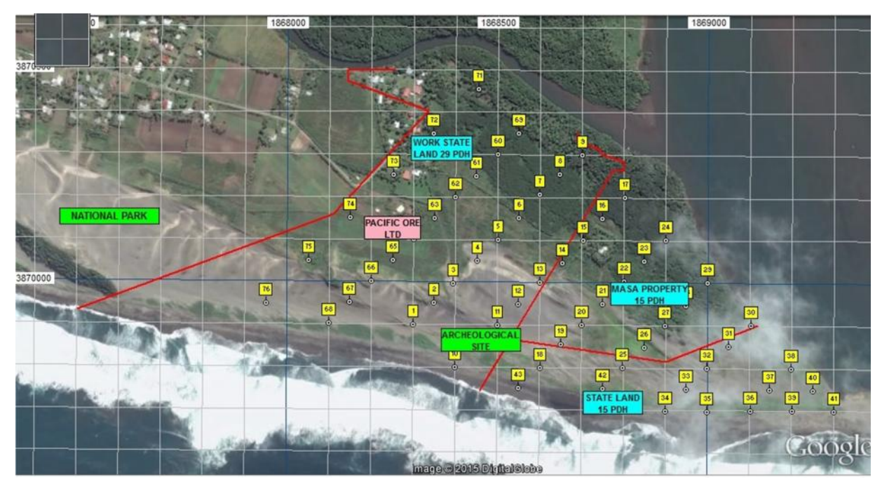
Figure 3 - Image of freehold land showing approximate location of planned sonic drill holes