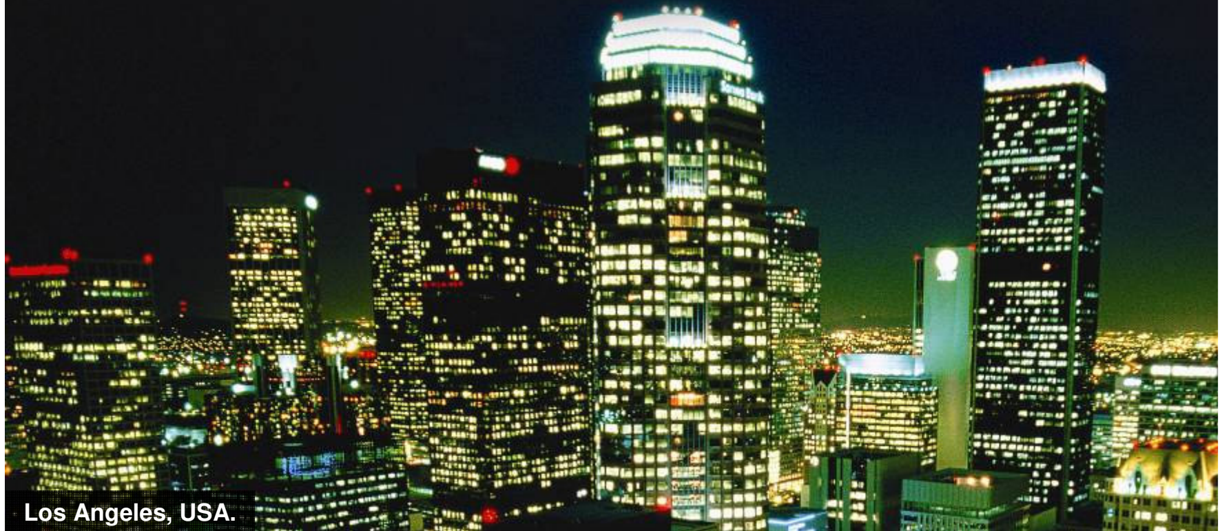
Los Angeles, USA.