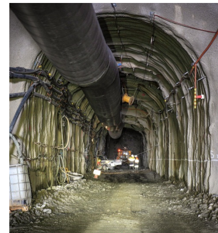
Ranger 3 Deeps exploration decline