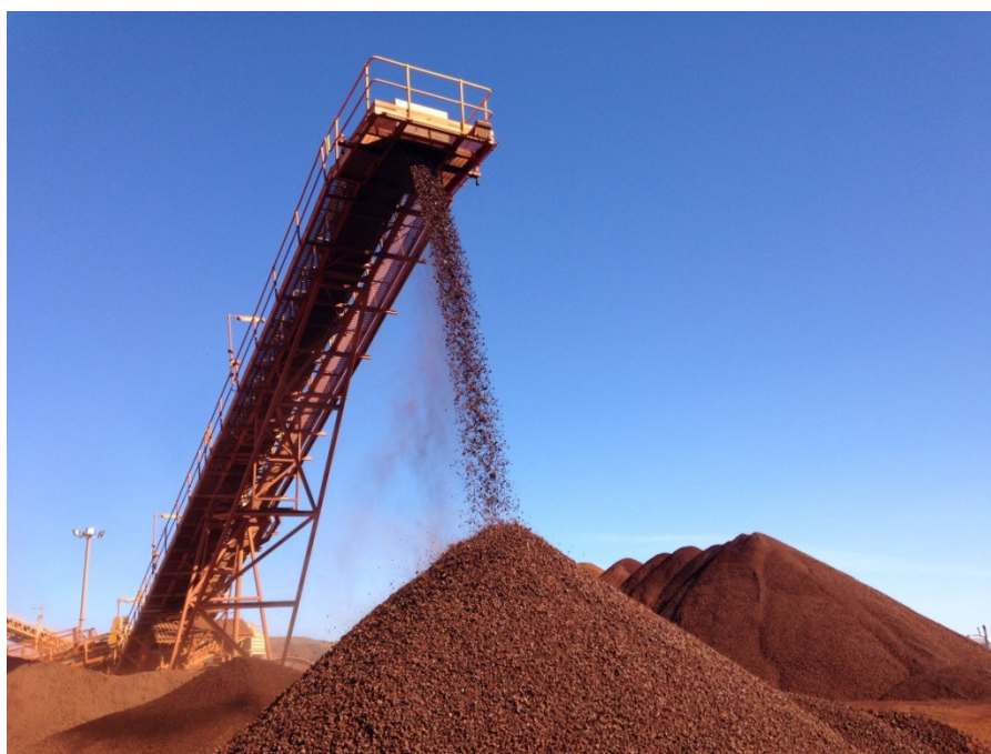
Photo: Iron Valley lump product

As part of the drive to continually lower costs, MRL is also actively engaged with the State Government, stevedoring provider and the Pilbara Ports Authority to secure a reduction in their respective charges for stevedoring services and shipping iron ore through the Utah Point facility. These charges are unsustainable in the current economic cycle and a substantial reduction in these charges is being sought to help offset the impact of very low iron ore prices and to ensure that the mid-tier miners have access to cost effective and competitively priced port facilities in the Pilbara.