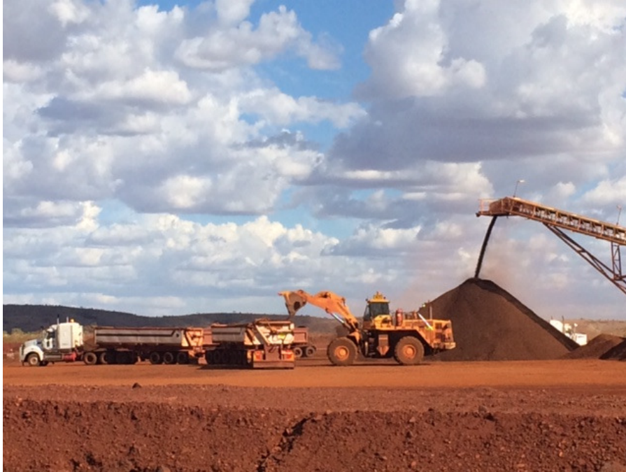
Photo: Loading of an Iron Valley road train

The performance of the mining and crushing operations during the quarter achieved budgeted performance. Mining and crushing schedules were reconfigured to maximise higher value lump production and export sales. Haulage and shipping of product were marginally below plan due to seasonal wet weather and implementation of the strategy of only exporting lump. Lower grade fines have been stockpiled on site for opportunistic sales as they arise and as a feed source for a beneficiation plant in the future.