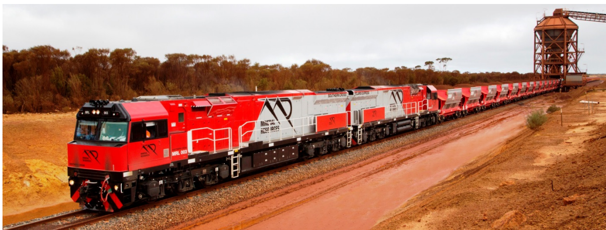
Photo: Carina locomotives and rolling stock

As part of the process to continually reduce costs, MRL is also actively engaged with the State Government, Fremantle Port Authority and the below rail provider to secure a reduction in port and below rail charges for the Carina operations. At this stage, port and below rail charges are the only remaining cost activity areas which have not been subject to cost reductions and are critical to the maintenance of long-term operations. An alternative port arrangement for Carina exports is also being investigated as a means of potentially achieving further cost reductions via lower port charges and the use of more cost effective Cape size vessels.