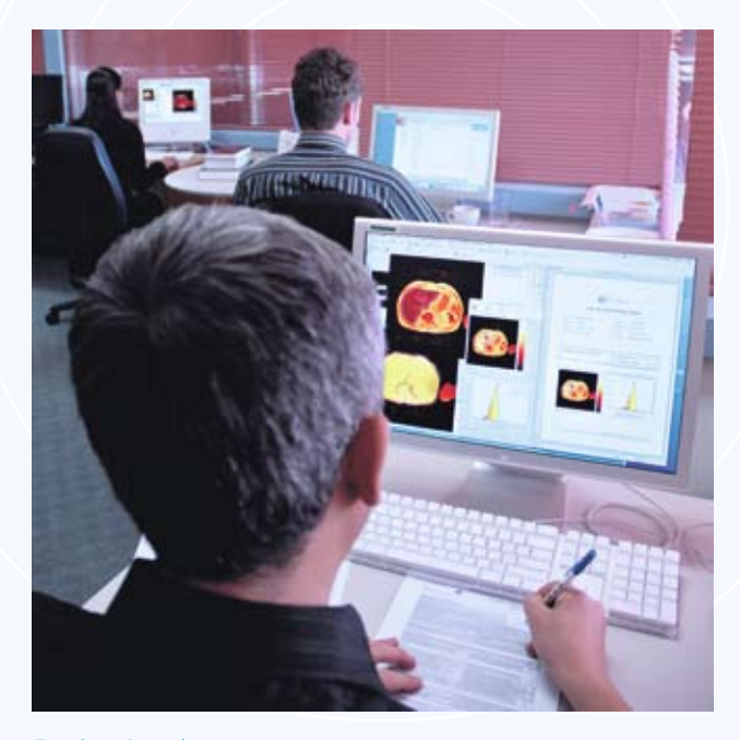
FerriScan<sup>®</sup> analysis in progress.

The Company also concluded a multi-centre study of 60 patients to validate a 60% reduction in scan time. FerriScan® Rapide is now on the market, significantly improving the cost effectiveness of the service.