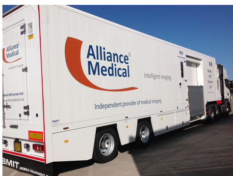
Alliance Medical's FerriScan-certified MRI Scanner on Wheels

For more information on booking, logistics and costs to book the scanner please contact the Alliance Medical business development department on 01926 482222.