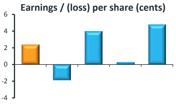
Dec 2014 Jun 2014 Dec 2013 Jun 2013 Dec 2012