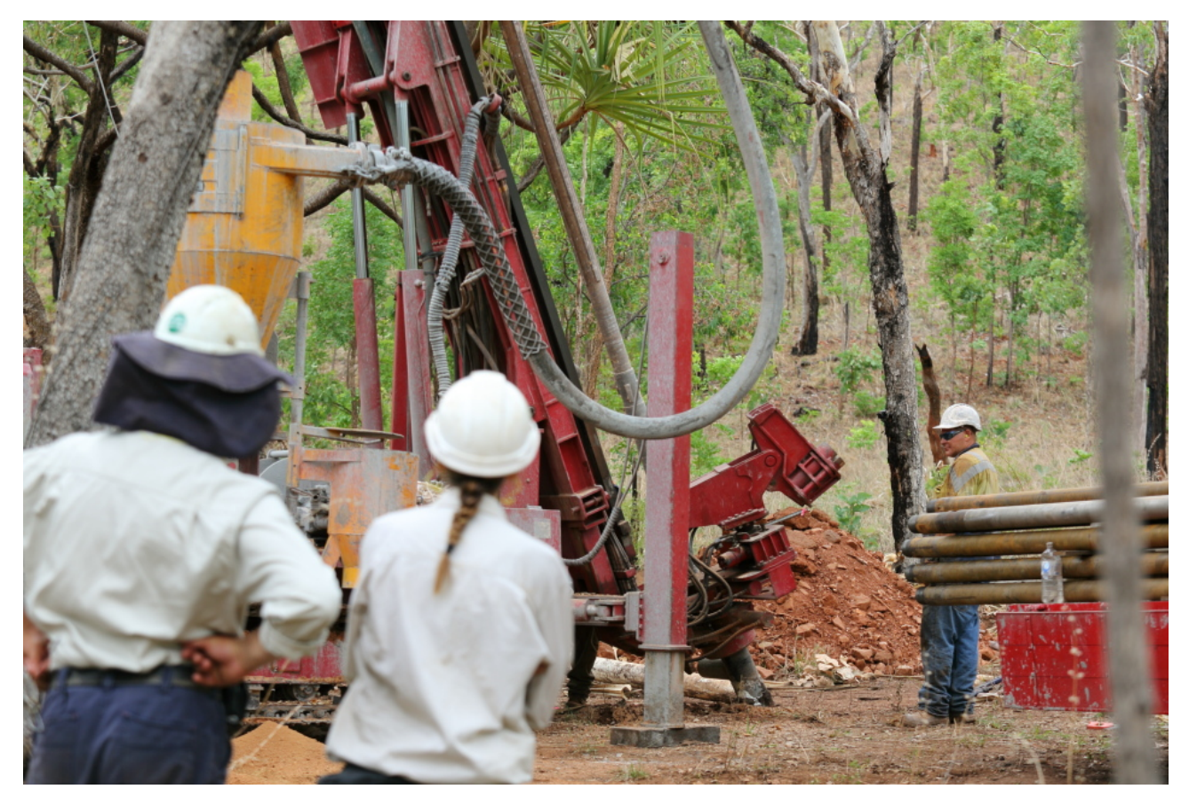
Figure 2. Thundelarra personnel monitor RC drilling progress at Nipper Prospect, Allamber.