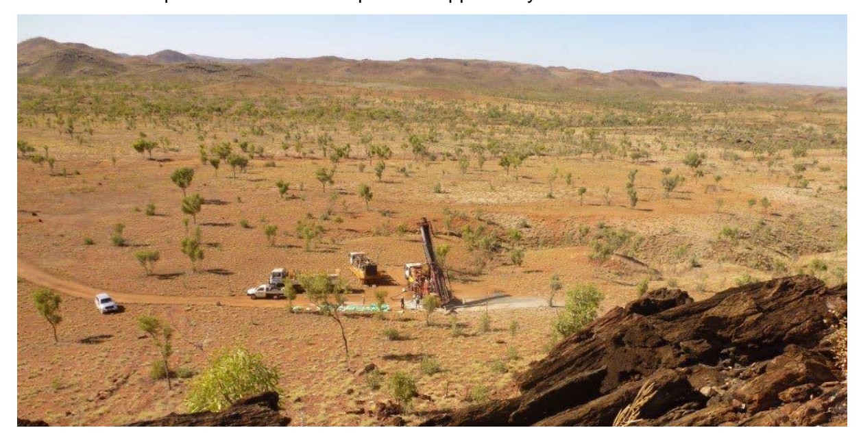
Figure 3. Drill rig at Sophie Downs.

The geology is complex but the presence of these significant zinc intersections, together with elevated copper and lead mineralisation, suggests the possibility that metal zonation may exist and also that repetitions of the lenses of mineralisation encountered in this small program may exist elsewhere nearby. The potential represented by these results warrants detailed follow-up, which Thundelarra will pursue at the earliest possible opportunity.