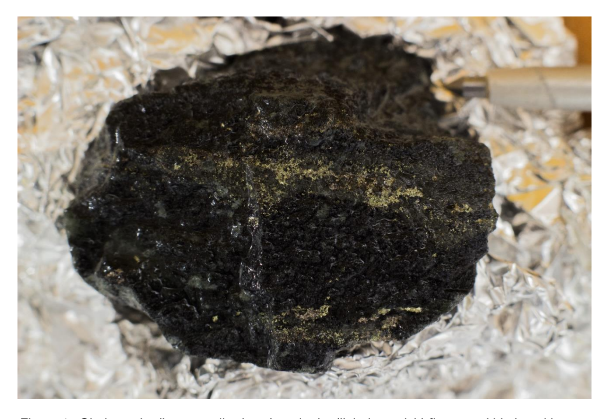
Figure 1. Chalcopyrite (brassy yellow) and pyrrhotite (light brownish) fiamme within basaltic lavas at 114m in hole TRBC113. Chip shown is approximately 1cm across in size.

The significance of the geological features encountered will be evaluated fully in the context of the DHEM survey results and multi-element geochemical analyses when they have been received and interpreted.