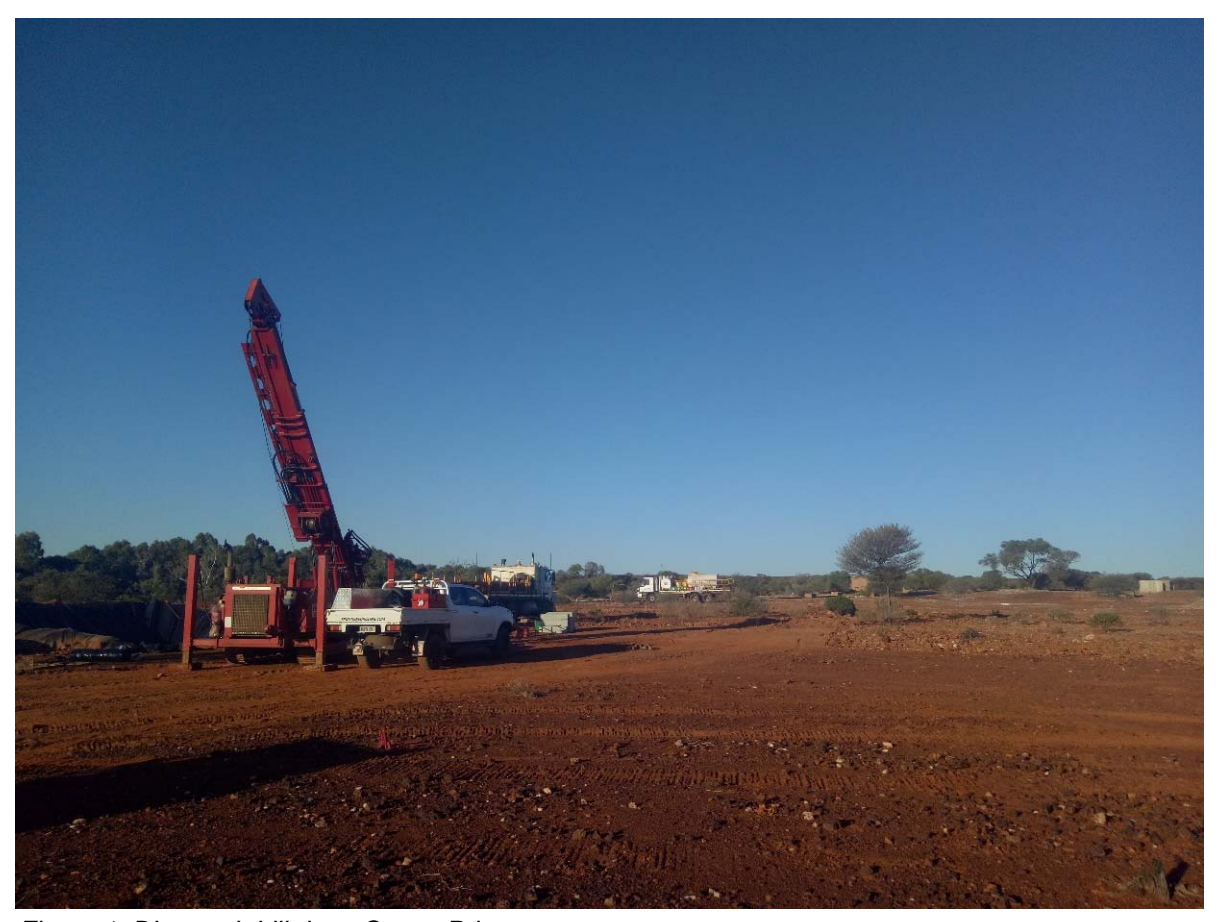
Figure 1. Diamond drill rig at Crown Prince.

This first programme is designed to comprise 12 holes for a total advance of about 2,000m although these figures may change depending on the data generated as the programme progresses.