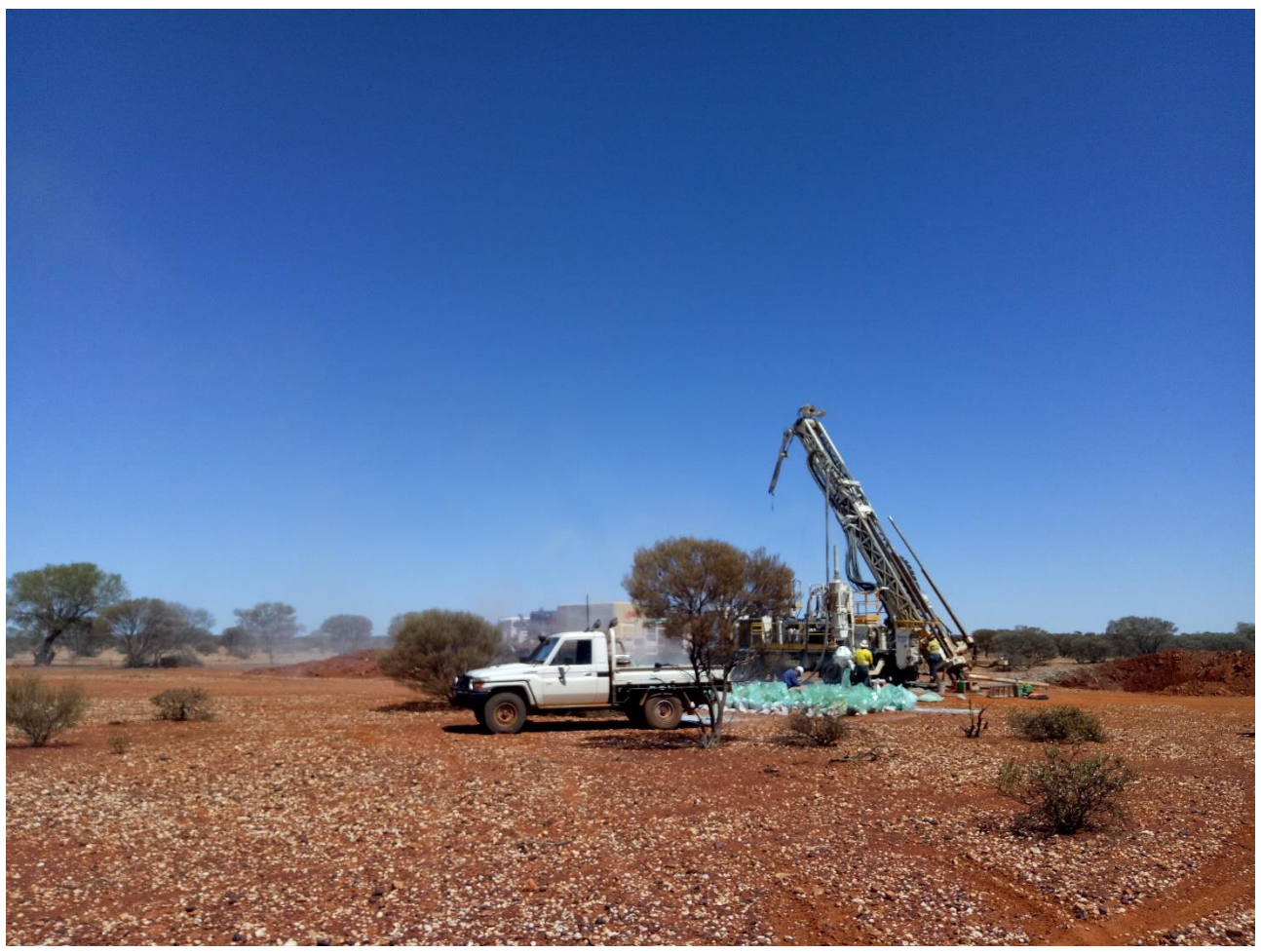
Figure 1. Reverse Circulation drill rig at Lydia Prospect, Garden Gully.

This programme is designed to comprise approximately 13 holes for a total advance of about 3,000 – 3,500m although the final number of holes and the total metreage drilled may change depending on the data generated as the programme progresses.