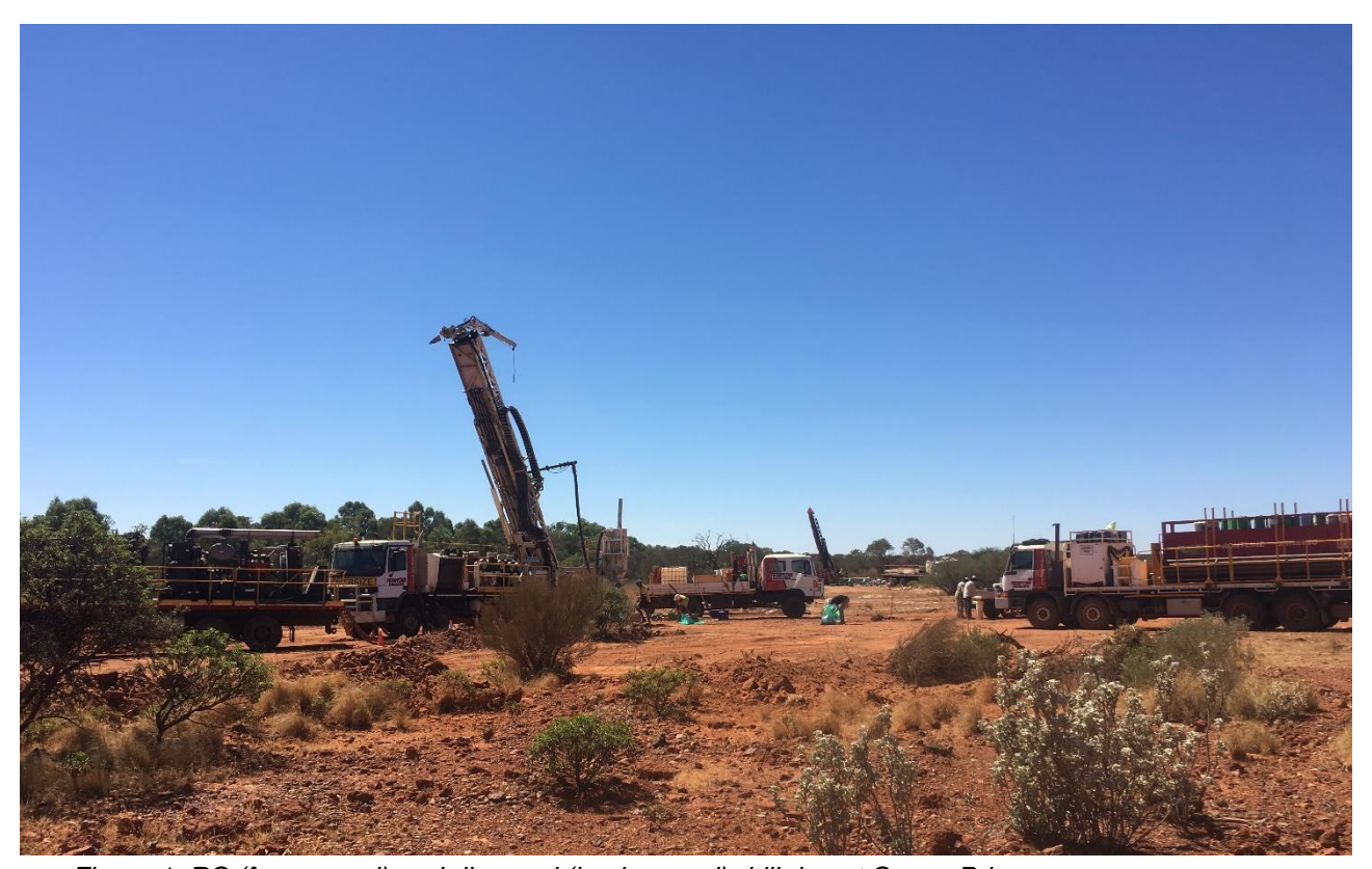
Figure 1. RC (foreground) and diamond (background) drill rigs at Crown Prince.

This RC and DD programme is designed to comprise 10 RC holes for a total advance of about 2,500m and 7 DD holes for a total advance of about 2,000m. The final number of holes and total metreage will depend on the data generated as the programme progresses.