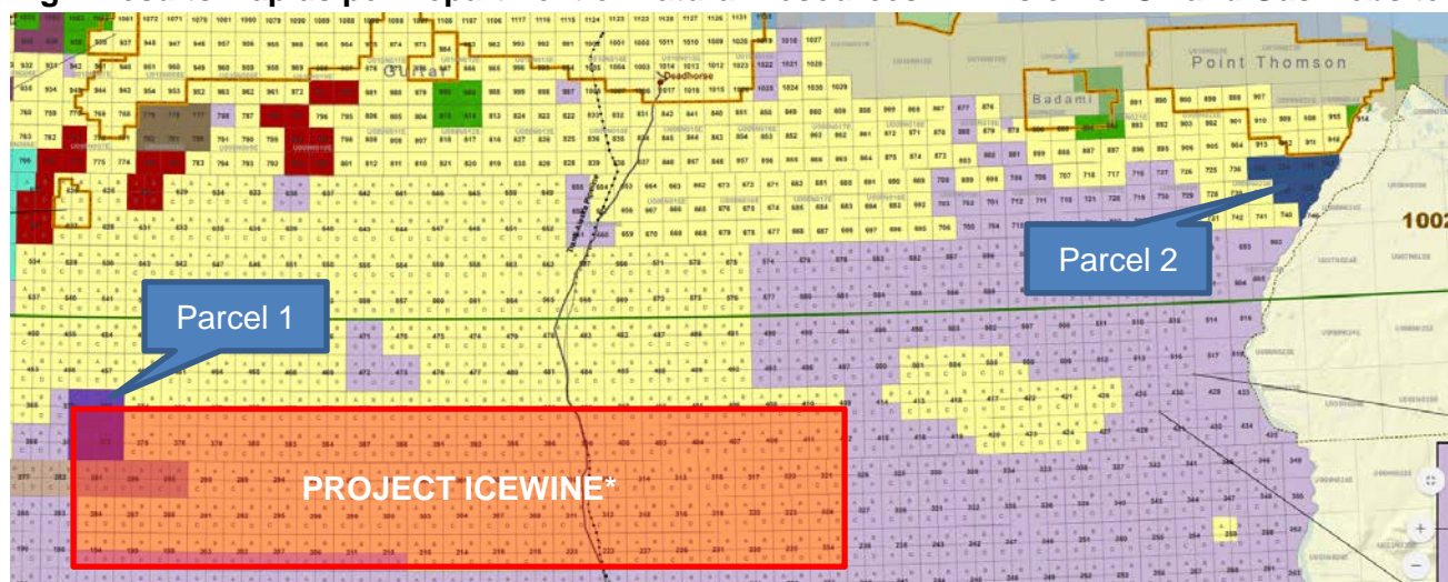
Fig.1 Results Map as per Department of Natural Resources – Division of Oil and Gas website

*approximate outline of existing acreage currently under award