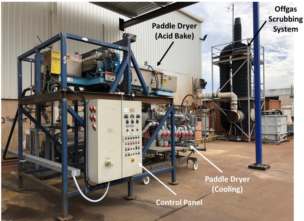
Figure 1b: Phase 4 Acid Bake Pilot Plant at SGS Awaiting Installation of PLR Feeder and Pug Mixer