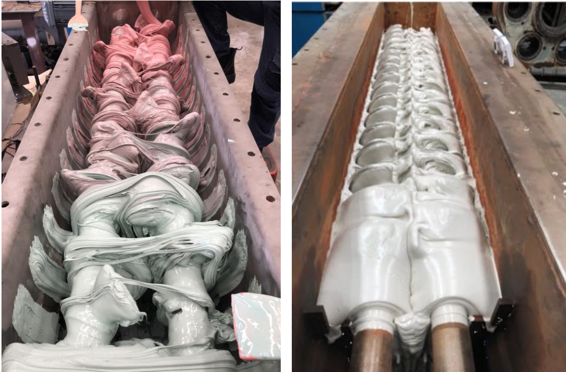
Figure 4 Sulphated Nolan's material being cooled in Gouda (L) and discharging (R)