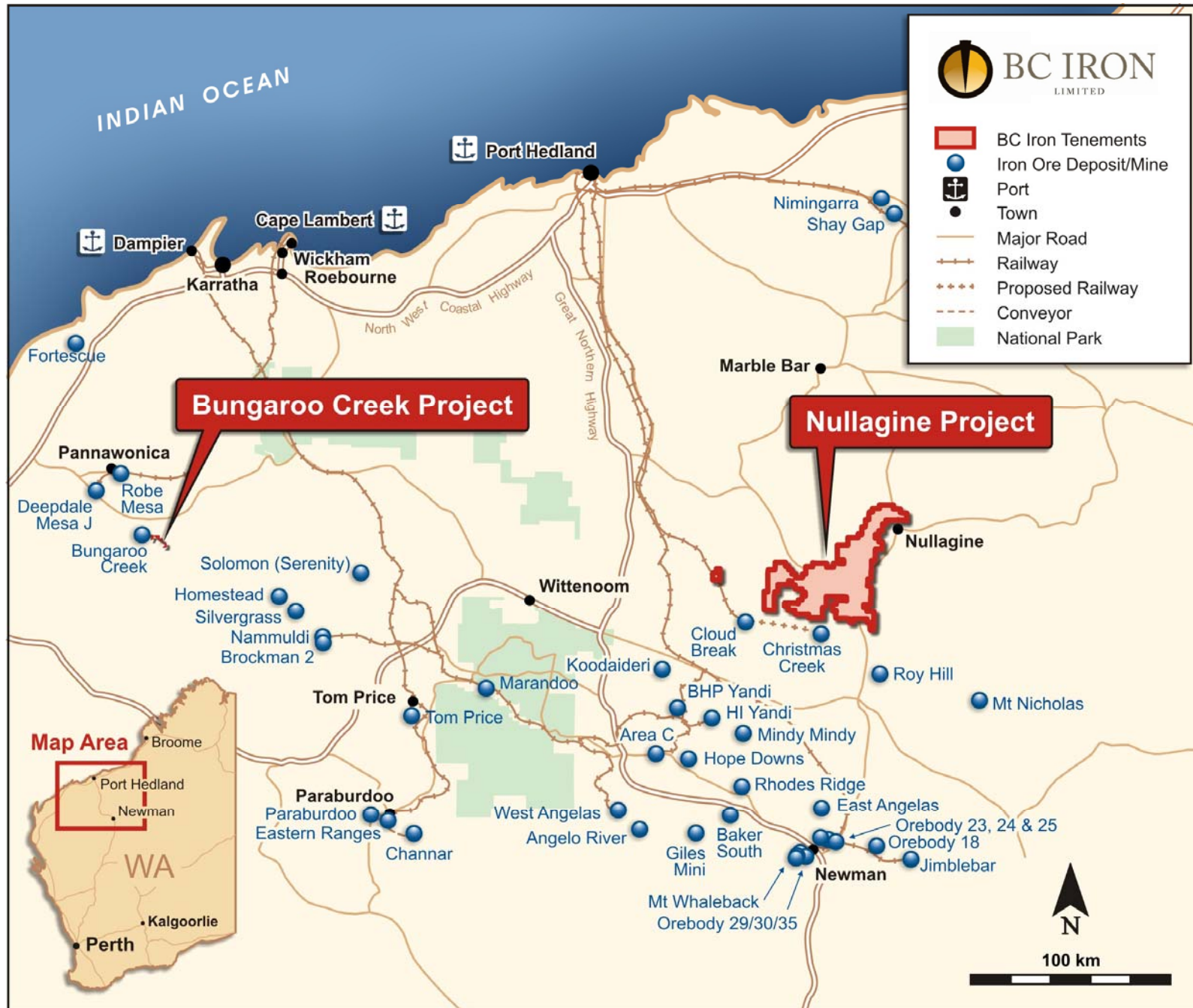
Figure 1 – Location plan of BC Iron’s Pilbara projects