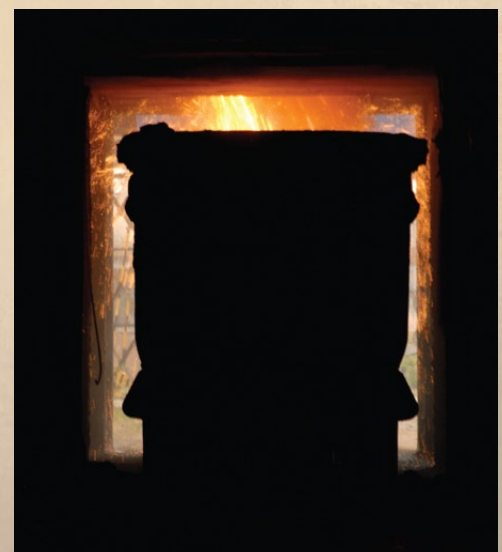
HOT IRON METAL POURING INTO LADLE, CHINESE STEEL MILL