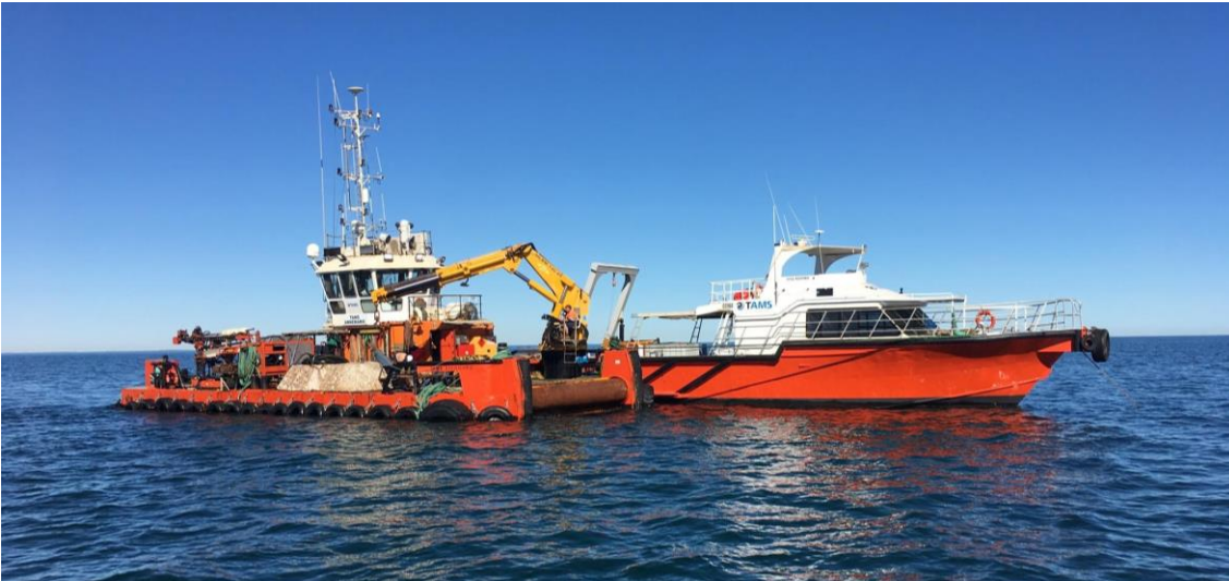
Figure 1: Marine Geotechnical Drilling Vessels & Equipment at Mardie