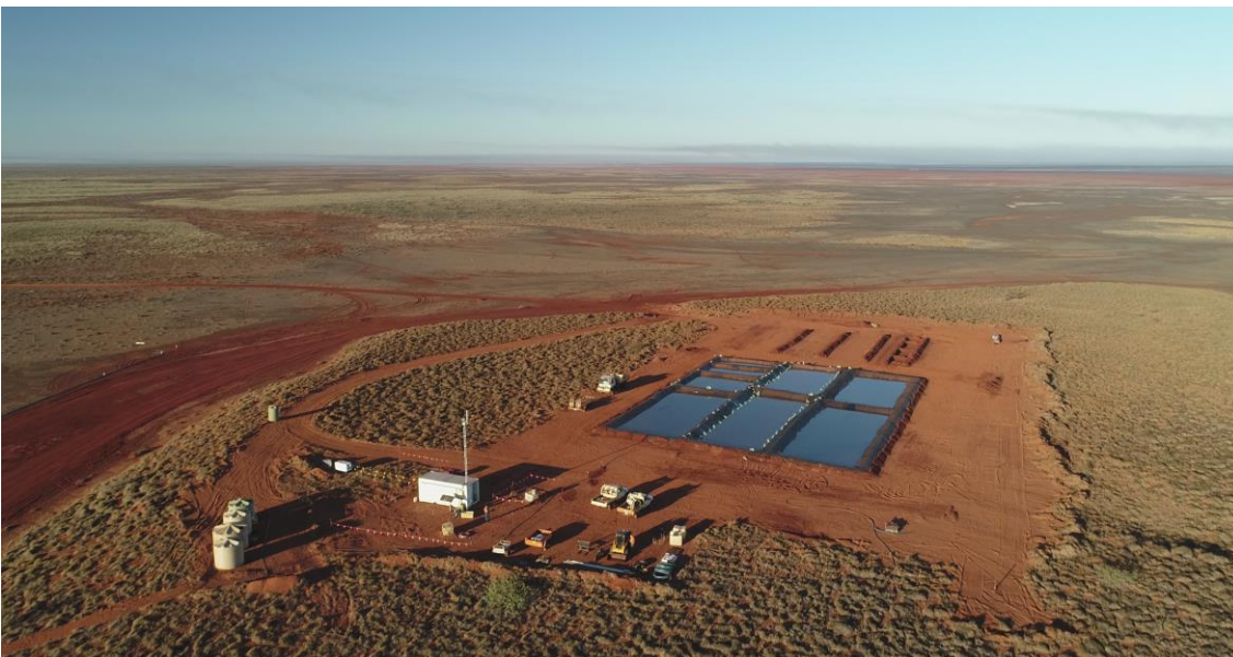
Figure 2: Small-scale Trial Ponds

Construction of the small-scale trial ponds was completed during the June 2019 quarter and they are now operational. The evaporation ponds have been filled with Mardie seawater and the SOP crystallisers have been filled with potassium-rich bitterns secured from a nearby salt operation to fast-track this part of the trial. The salt crystallisers will be filled with brine once the density of evaporated seawater reaches sufficient levels.