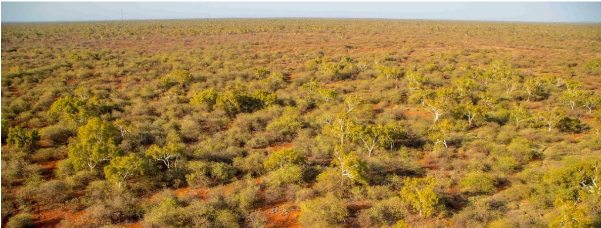
Figure 2: Mesquite – an introduced species and declared a pest in WA

BCI will now cooperate with various authorities to finalise the secondary approval assessments which will enable development to commence as proposed in the Environmental Review Document ('ERD') based on Mardie's Definitive Feasibility Study ('DFS') which included all land and marine areas for a 4.4Mtpa salt operation and its associated port facilities.