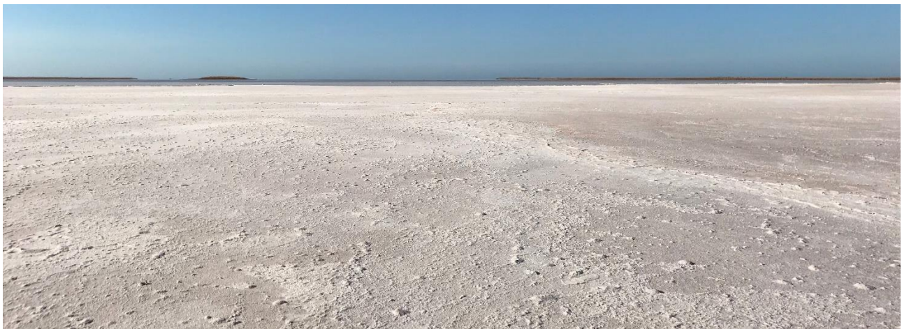
Figure 1: Salt crusted mudflats at Mardie (5km from coastline)

Mardie's footprint was planned approximately 5km inland from the coastline, resulting in the Project having minimal impact on coastal vegetation which includes algal mats and samphire flora. Barren mudflats make up more than 90% of the pond area, with another proportion of the final Project footprint covered by Mesquite, which is an introduced species and declared a weed in Western Australia. BCI will work with authorities to clear and eradicate the weed from specific Project areas.