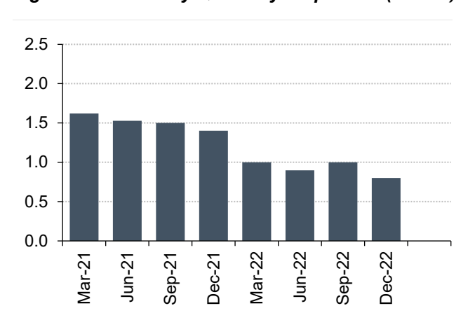
Figure 7: Iron Valley Quarterly EBITDA<sup>1</sup> (A$M)