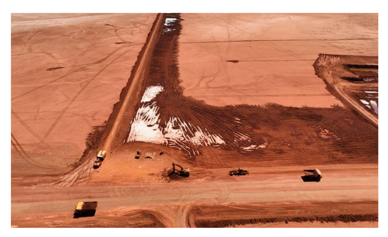
Figure 3: Pond 3 levee construction