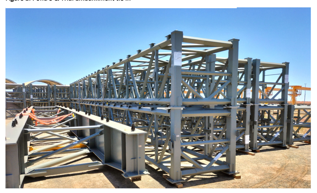
Figure 2: Jetty Structural Steel - Dampier