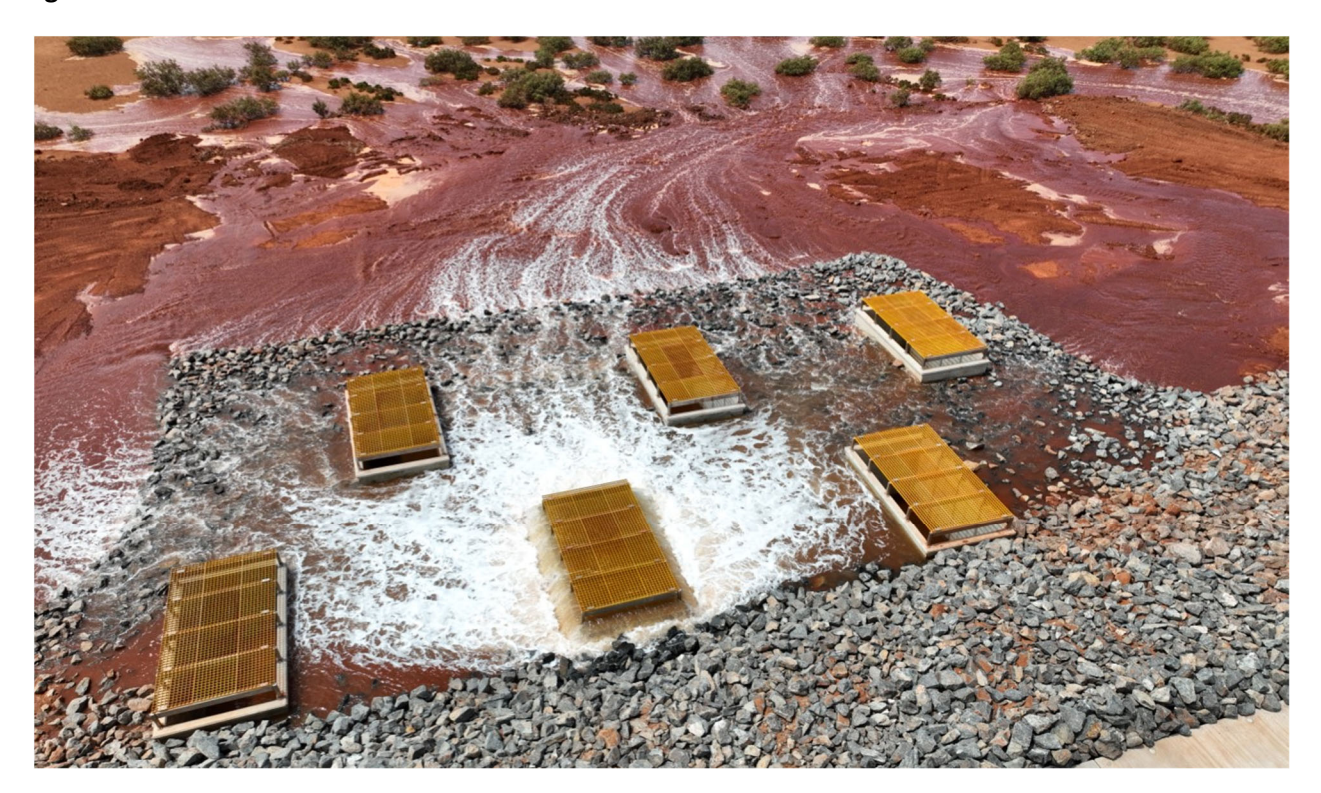
Figure 4: PSI diffusers – pump testing