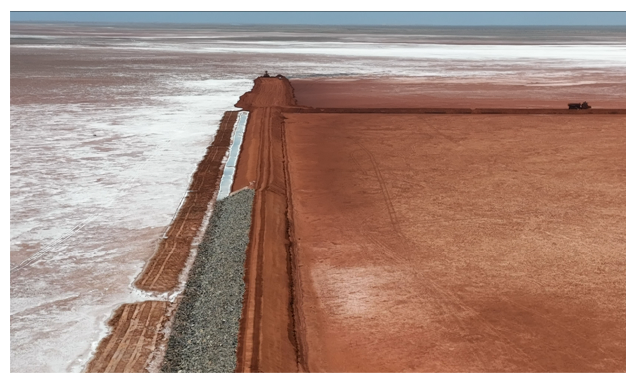
Figure 1: Pond 5 & Trial Embankment tie in