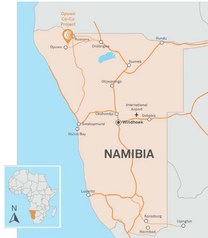
Figure 2: Location of the Opuwo Cobalt Project, Namibia