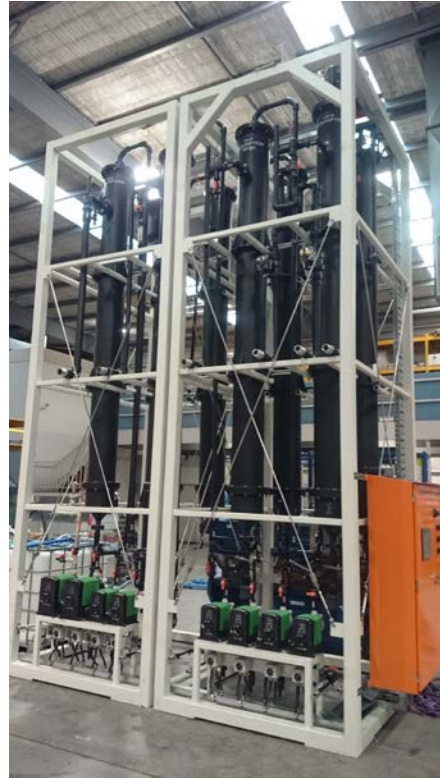
Figure 2: The pilot plant ready for shipping.