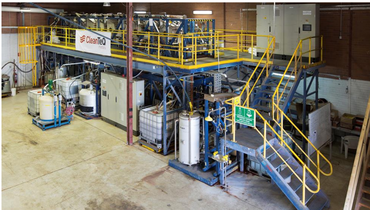
Clean TeQ's proprietary Resin-In-Pulp (cRIP) process demonstration plant

During October and November 2015, representatives from Clean TeQ attended a number of meetings in North America and Europe with a range of potential scandium oxide offtake counterparties. Those discussions confirmed that there is a significant amount of work being undertaken by the aerospace industry (and others) to evaluate the use of scandium in a range of industrial products and applications.