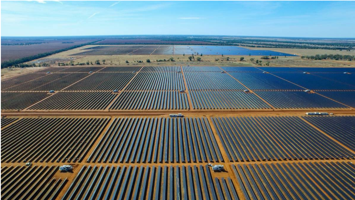
AGL's Nyngan Solar Farm, Central New South Wales

The capital and operating cost estimates contained in the Sunrise Project Execution Plan 1 ('PEP') assumed Sunrise would purchase supplemental energy directly from the NSW grid. This entailed construction of a longer electrical transmission line from site to the regional centre of Parkes. This cost was included in the PEP capital cost estimate and it remains an important enabler for providing options for renewable power supply. Accordingly, there is no capital cost impact from adopting 100% renewable electricity supply, when compared with the base case PEP cost assumptions.