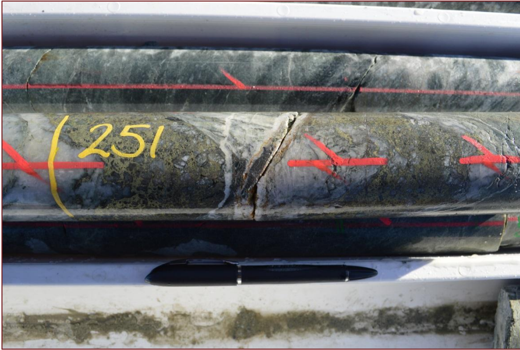
Figure 2. Chalcopyrite mineralisation in quartz-carbonate veins at 251m.

Mineralisation occurs as discrete zones of approximately 20cm width at 194m and 251m downhole within a broad alteration envelope including pyrite – pyrrhotite with trace chalcopyrite. Mineralisation is hosted by mafic granulites and Giles-age gabbro-norites, broadly analogous to Succoth Prospect host rocks. The alteration zone extends between 115m to 252m down hole. While mineralisation is quite narrow, the tenor of mineralisation and scale of alteration zones is a positive indication that the hole has drilled the periphery of a significant new mineralised system and highlights the prospectivity of the tenement package stretching now over 30km (Figure 3). Prospectivity of the One Tree Hill area is further augmented by the fact that most of the conductors targeted by CZD0008 were not detected by the historical surface EM surveys due to suboptimal orientation of the plates and masking cover sequence.