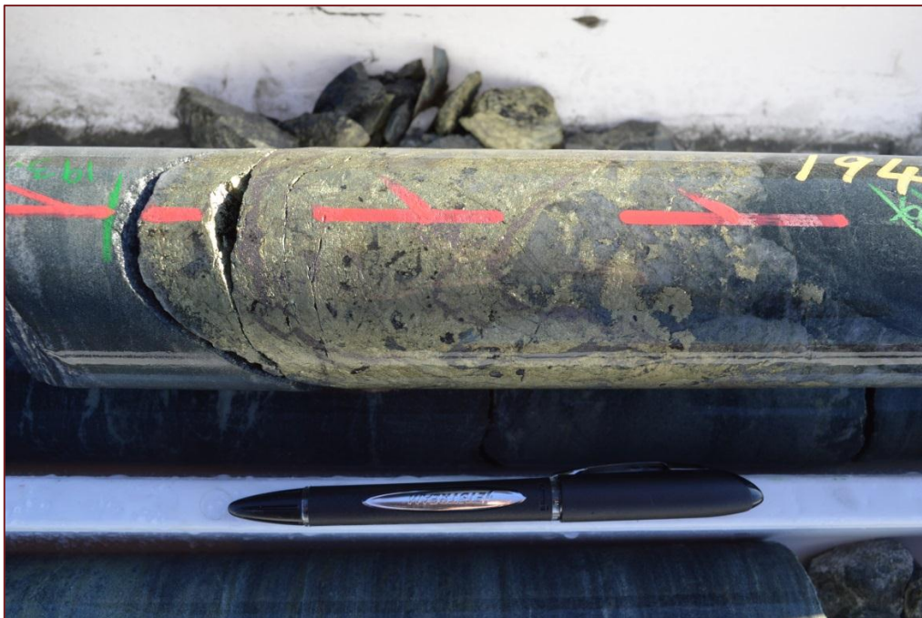
Figure 1. Massive chalcopyrite and pyrrhotite vein in mafic granulite at 194m.

Cassini has completed its first hole (CZD0008) at the One Tree Hill Prospect and intersected significant copper mineralisation over short intervals within a broad alteration zone (Figures 1 and 2). The hole targeted a number of poorly constrained surface and down hole EM anomalies that had not been fully tested by previous drilling.