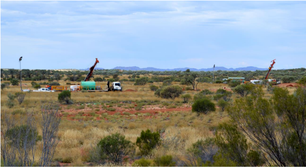
Figure 1. Drilling metallurgical diamond holes at Nebo

Other activities over the coming months include: