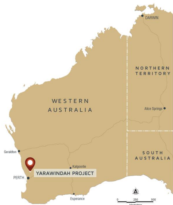
Figure 1. Yarawindah Brook Project Location.

A third new anomaly, XC14, has an extent of 100m, and also appears to be associated with a strong NW-SE trending structural feature in the centre of the project area. Similarly, this anomaly has no surface expression.