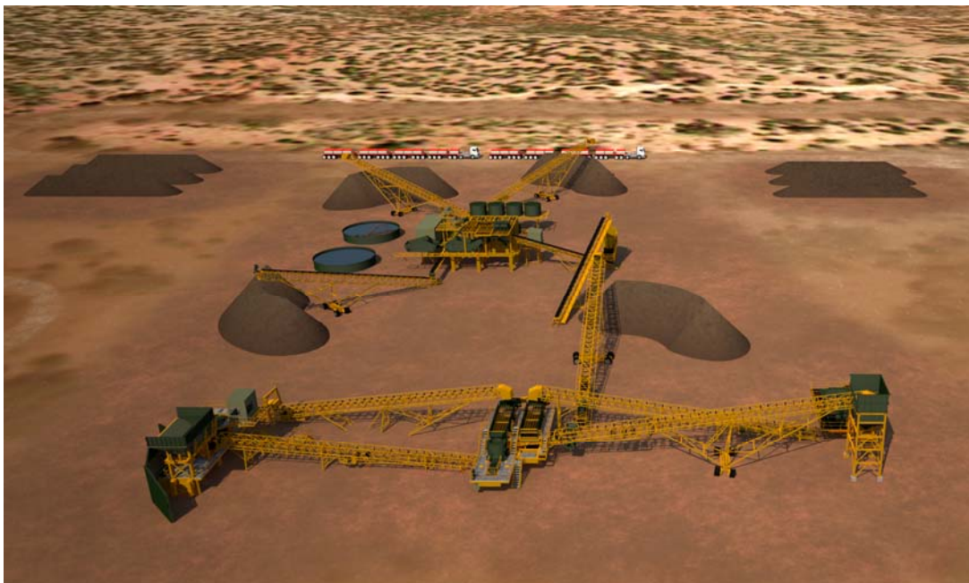
Picture 1 Proposed Mt Marion Lithium Plant layout

Production is expected to commence in second half of FY2011 at an initial rate of 200,000tpa of spodumene concentrate grading nominal 6.5% Li 2 O, containing some 13,000 tonnes lithium oxide (Li 2 O). Total contained lithium oxide resources at present are 146,000 tonnes (Li 2 O). The Joint Venture was recently expanded to include mica, tantalum and potash feldspars; testwork has highlighted the potential to recover significant volumes of these by-products.