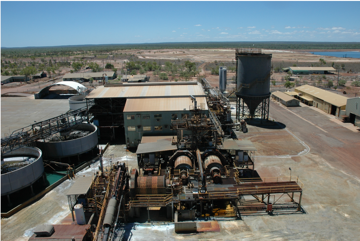
Figure 1 Thalanga Mine Site