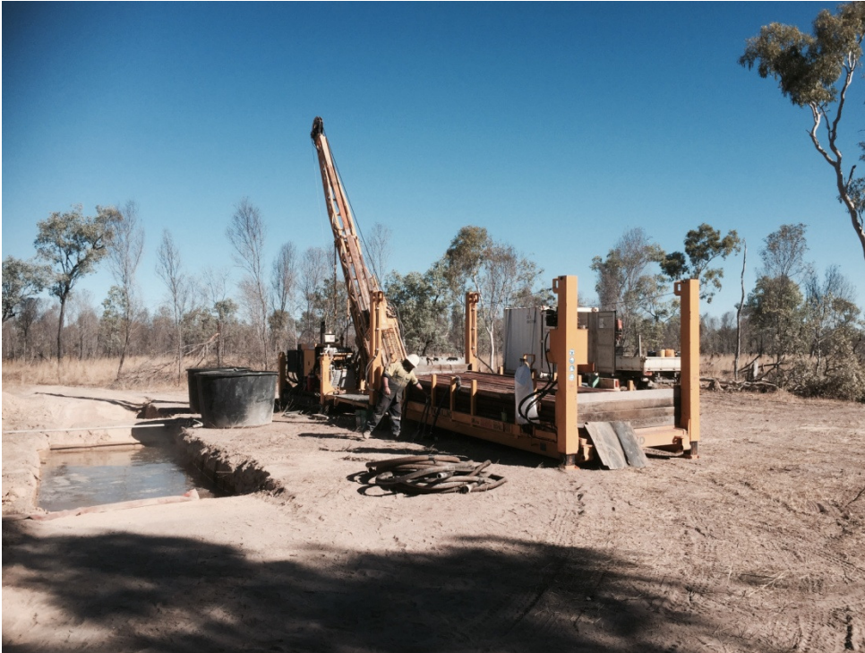
Figure 1 Diamond Drill Rig at Hole TH664