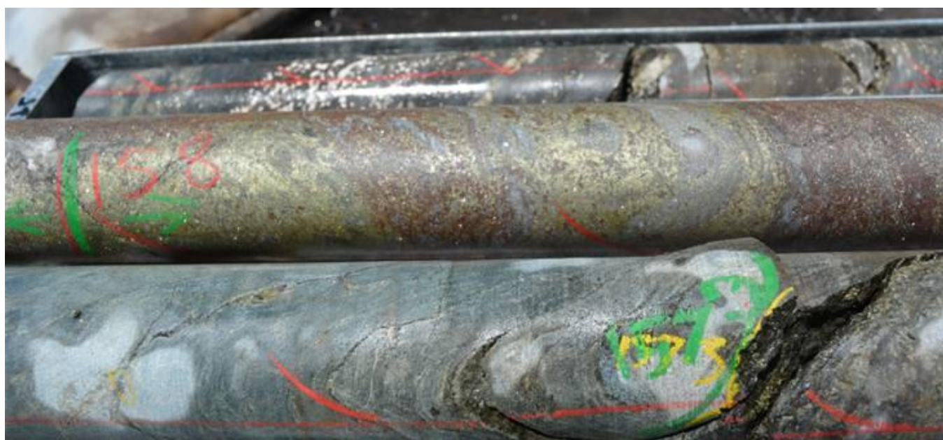
Figure 1 Massive sulphide mineralisation intersected in TH672 with abundant visible sphalerite and chalcopyrite

Sphalerite (zinc sulphide), (Zn,Fe)S, can contain up to 64% zinc and can be brown, yellow, red, green or black in colour