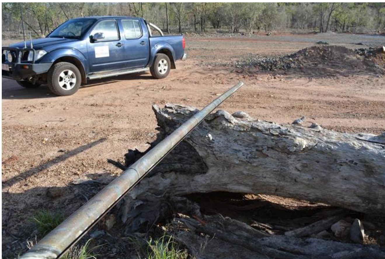
Figure 3 Massive sulphide mineralisation intersected in TH673 with abundant visible sphalerite and chalcopyrite

Assay results for both TH672 and TH673 will be released when received.