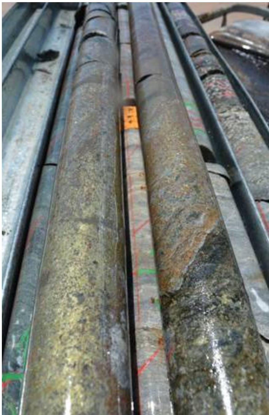
Figure 2 Massive sulphide mineralisation intersected in TH672 with abundant visible sphalerite and chalcopyrite

Diamond drill hole TH672 intersected 1.7m of massive sulphide mineralisation containing abundant sphalerite and chalcopyrite from 157.3m downhole. The hole was terminated at 180m depth. TH672 is being logged, and when the core has been cut, it will be submitted to the assay lab for analysis.