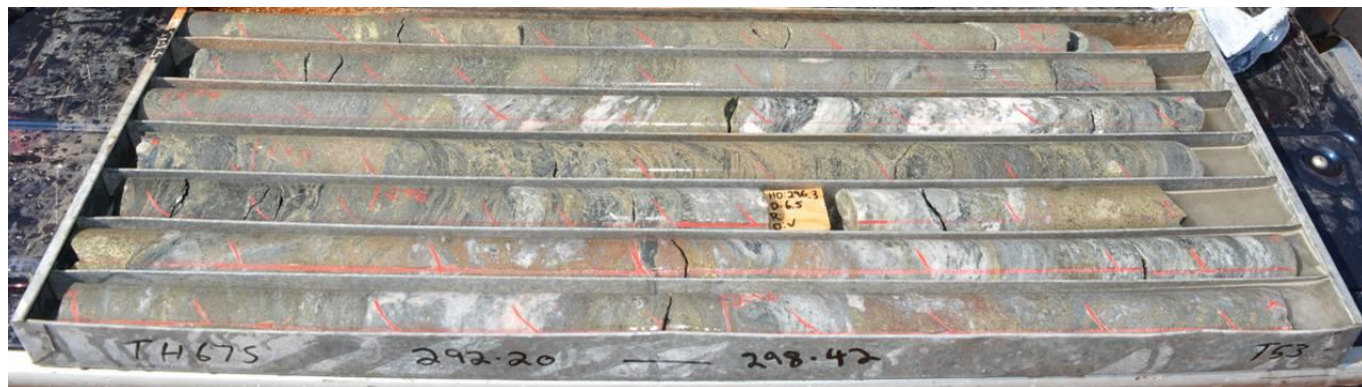
Figure 2 Massive sulphide mineralisation intersected in TH675 with abundant visible sphalerite and chalcopyrite