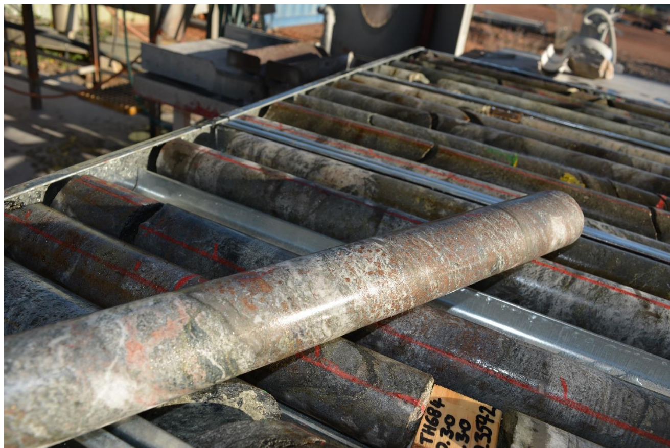
Figure 2 Sphalerite mineralisation from TH684