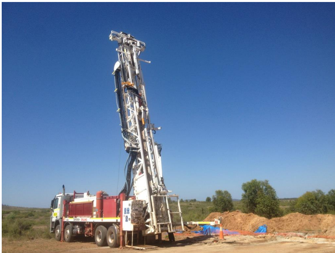
Figure 1 Universal rig commencing LTED04 at Liontown East target

Red River’s Managing Director Mel Palancian commented: “Following the mobilisation of a third drill rig to site, the pace of exploration activity has increased with two diamond drill rigs active at Far West and the third (universal) drill rig, drilling LTED04 at our Liontown East target.