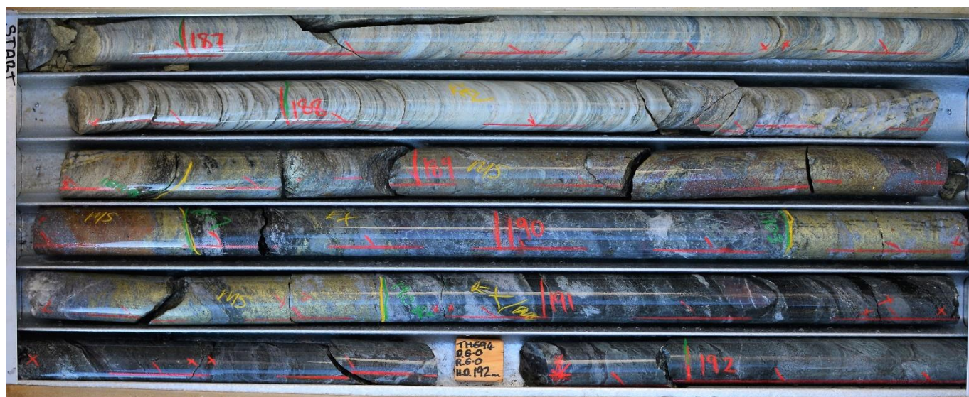
Figure 2 High grade massive sulphide mineralisation (2.05m @ 42.5% Zn Eq.) from TH684