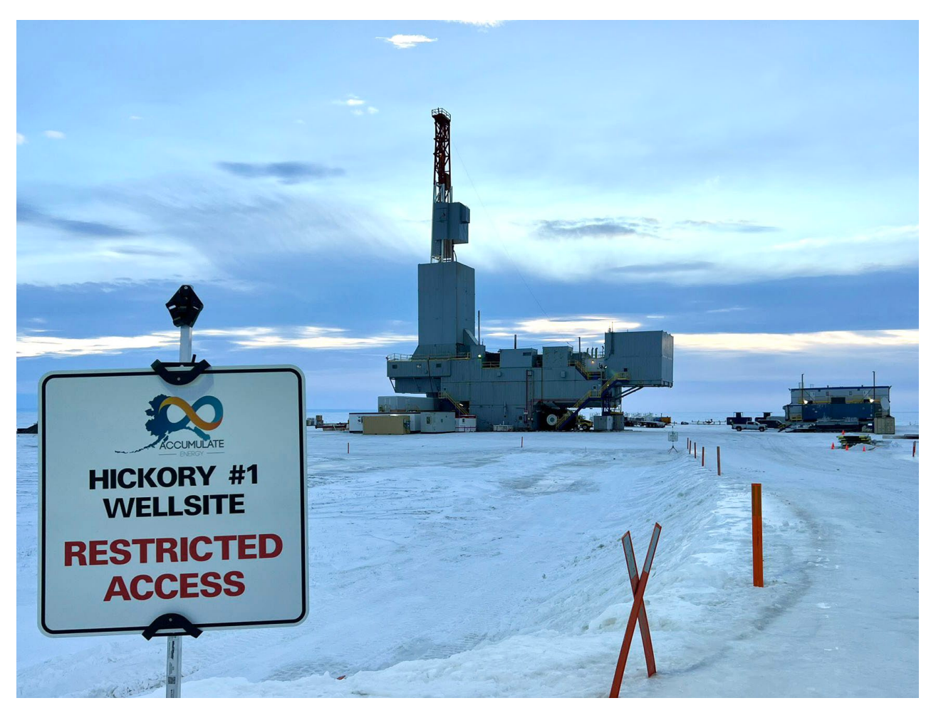
Figure 2: Nordic Calista Rig-2 and facilities at the Hickory-1 wellsite.