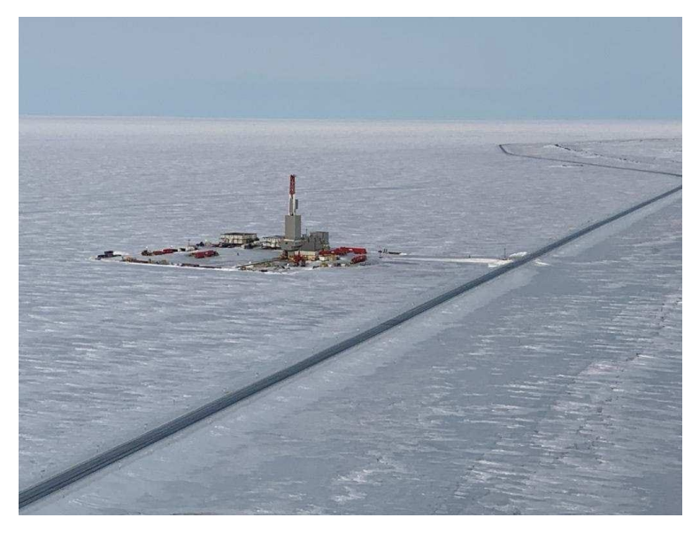
Figure 1: Nordic Calista Rig-2 at the Hickory-1 drilling location, adjacent to the Dalton Highway, North Slope Alaska.

The Company will provide further updates subsequent to Hickory-1 achieving TD.