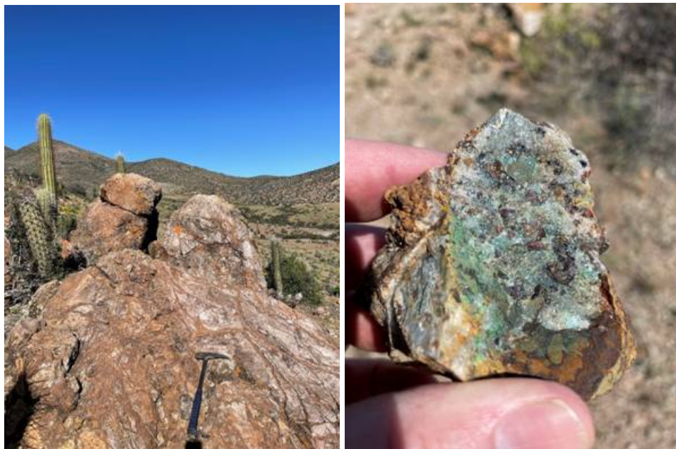
Figure 2: Brecciated quartz-carbonate vein structure at Teresita is traced over 1km along strike (l). High grade disseminated chalcopyrite-bornite (+gold) hosted in quartz fragments within the vein breccia (r).

At the Victoria prospect, Cu (+Au) mineralisation occurs as disseminated and coarse infilling sulphides within brecciated and albite-magnetite-specularite-actinolite altered volcanics that occurs in outcrop and as float over a broad area close to the contact between the host granodiorite batholith and the overlying altered volcanics (Figure 3). Assay results from reconnaissance rock samples are pending. Detailed mapping and sampling at Victoria is now in progress and will also be complemented with a ground magnetic survey in the first quarter of