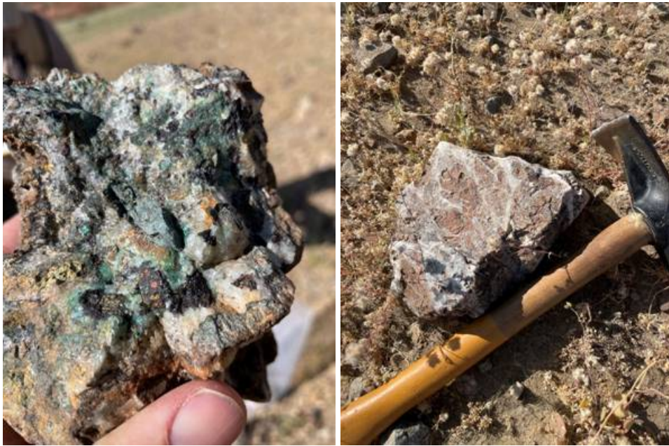
Figure 3: Copper sulphide mineralisation hosted in silica breccia, Victoria prospect (l), silica vein breccia float, Victoria prospect, Especularita (r).