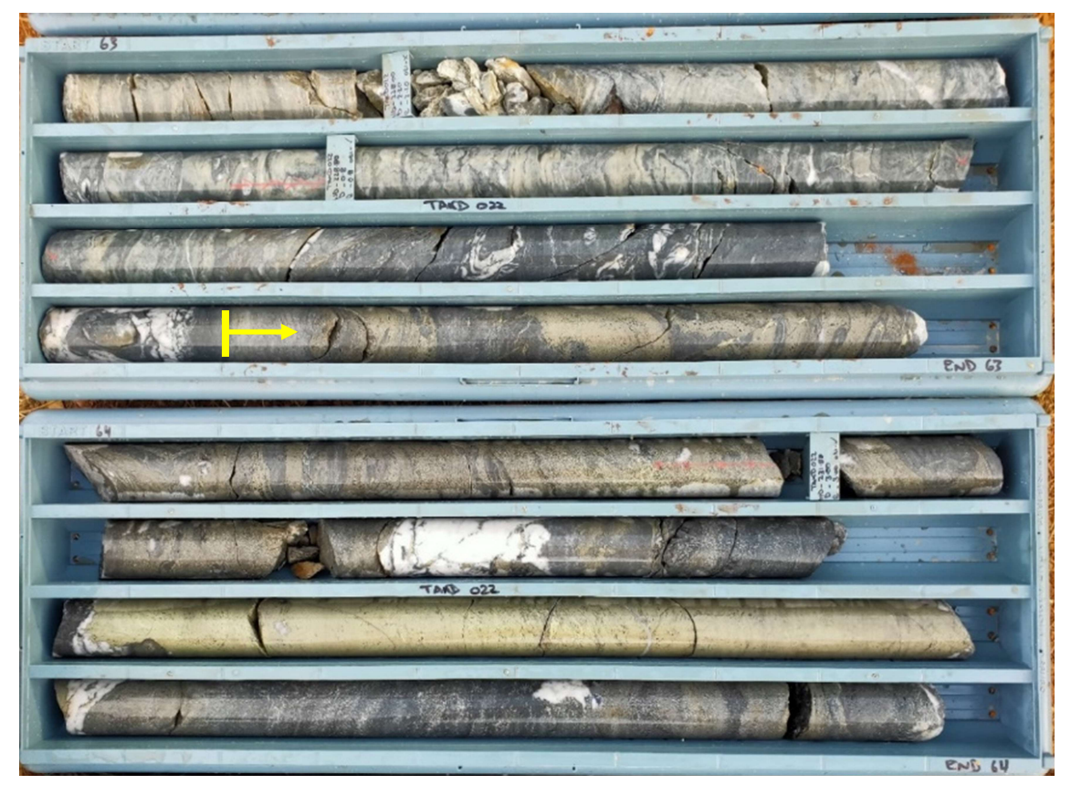
Figure 2 – Drill hole TAKD022 drill core photographs showing the sulphide horizon intersected from 228.6m down hole. Yellow arrows denote the sulphide interval.

Drill hole TAKD022 was designed to test the mineralised system 50m along strike (south) from TAKD005<sup>2</sup> (2.5m @ 6.10% Cu) and TAKD006<sup>2</sup> (5.85m @ 4.60% Cu). TAKD022 intersected an approximate 20m thick sulphide interval (assays pending) from 228.6m downhole. Massive sulphide lenses are prevalent throughout the sulphide interval (refer to Figure 3 below).