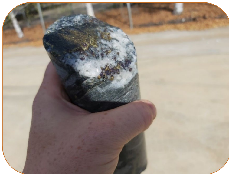
Figure 4: Bornite (Grey-purple) with coarse grained chalcopyrite (brassy) in sugary quartz, 142m - 142.05m (CANDD006)