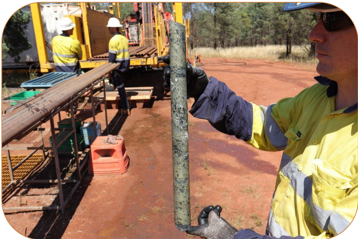
Figure 1 – Massive to semi-massive chalcopyrite intersected from 425.2 metres in CAND006 1