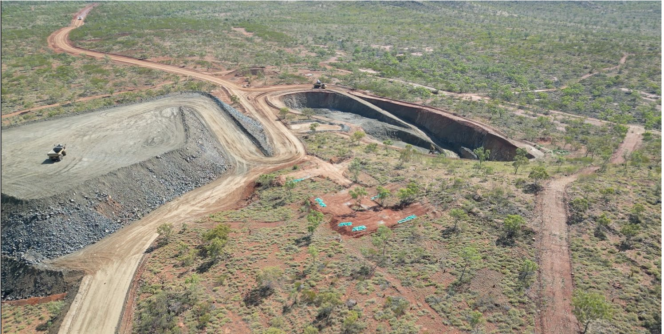
Image 3 - Aerial Photo of Golden Mile