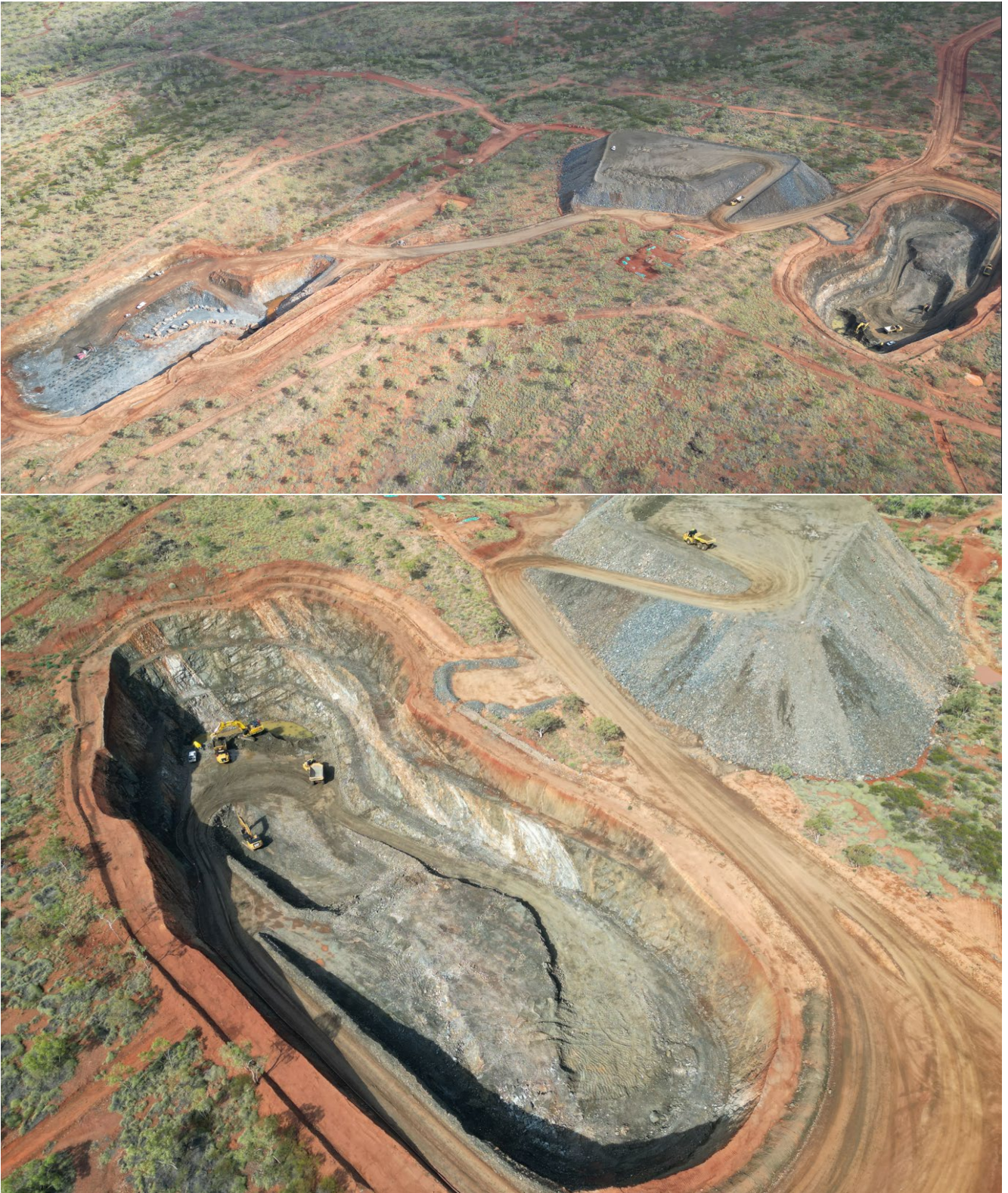
Images 1 & 2 - Aerial Photos of the Golden Mile Pits