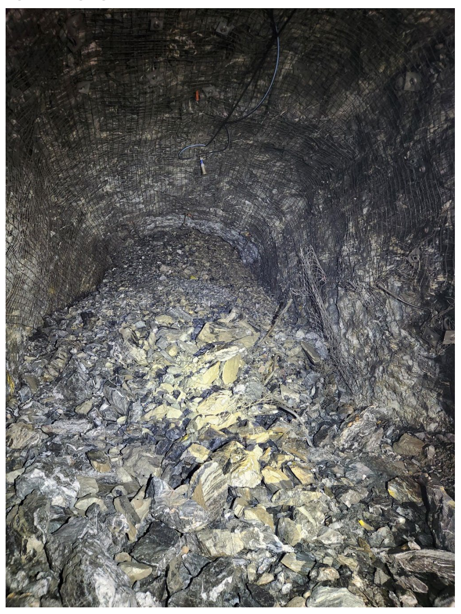
Figure 1: High-grade blasted ore at Avoca Tank

Escape ladderway installation to surface has been completed as planned, enabling stoping to commence. Trucking of the first Avoca Tank stope, delivering 11kt at ~3.0% Cu ore, commenced on 28th May. This high-grade ore will contribute to the significant increase in copper production forecast at Tritton for Q4.